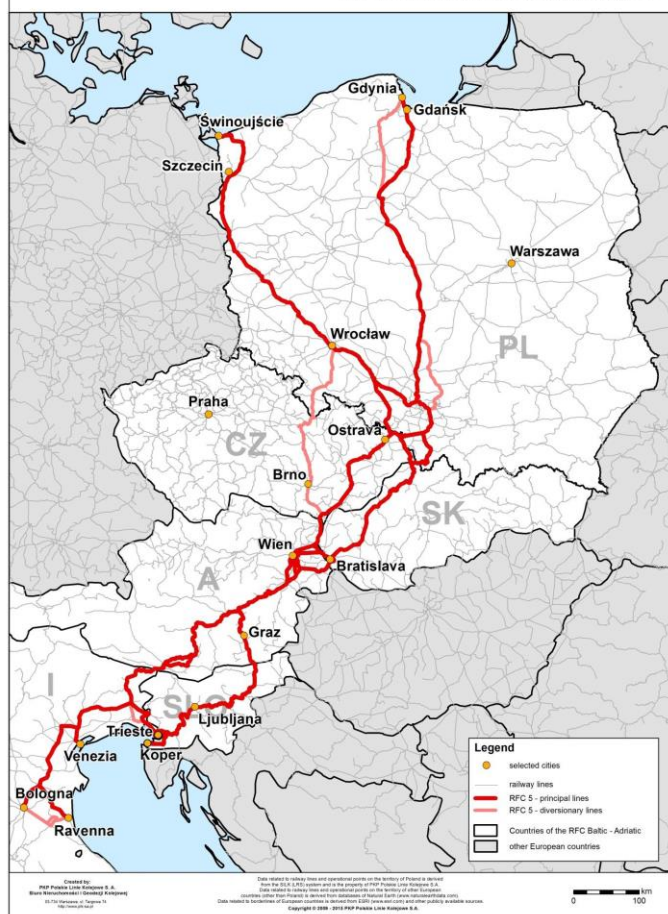
MAP OF RAIL FREIGHT CORRIDOR No. 5